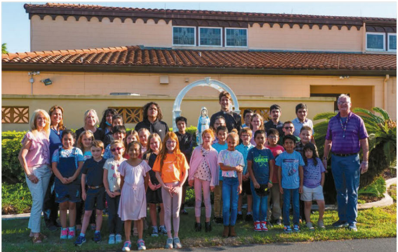
First Holy Communion Class of 2022