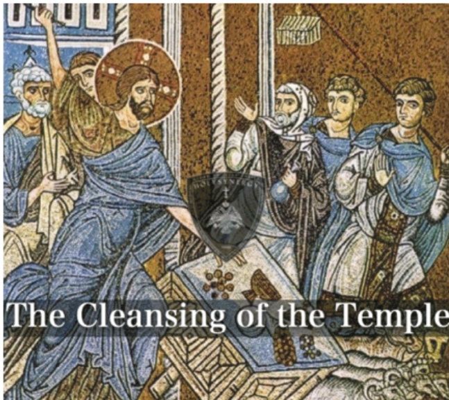
The Cleansing of the Temple